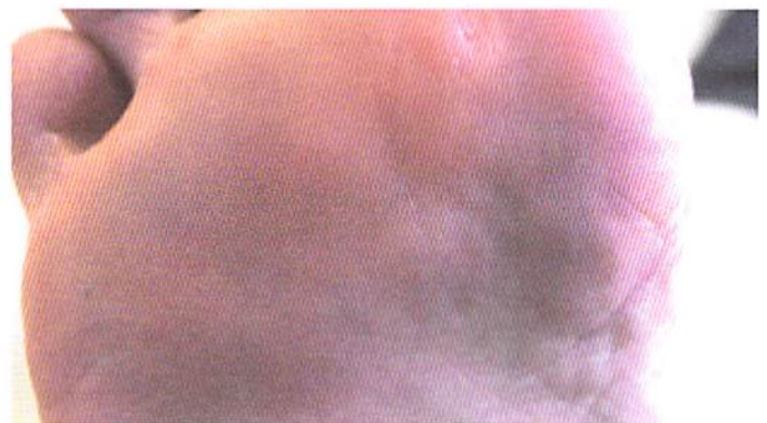
Figures 6a, 6b & 6c. A wart before, during and 12 months after microwave treatment demonstrating resolution