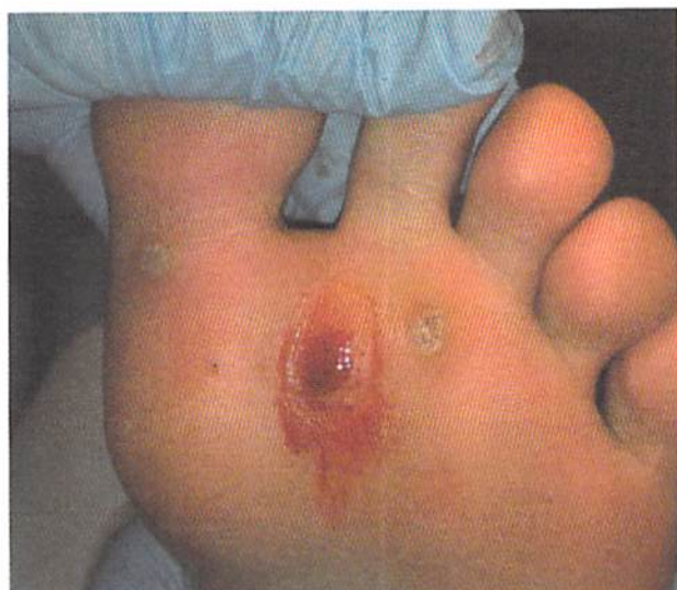
Figure 2. A plantar wart immediately after needling procedure (Longhurst & Bristow) 31