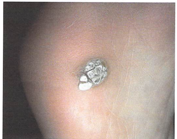
Figure 1. Plantar warts affect around 6% of UK adults

The human papilloma virus (HPV) is a double-stranded DNA virus with over 200 strains or genotypes 3 that have been recognised by DNA sequencing. The HPV is associated with the development of cutaneous tumours (warts and verrucae). Studies undertaken have identified HPV types 1, 2, 7, 27 and 57 as the most common