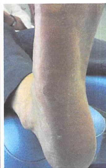
Figures 3a & 3b. A plantar wart before and after needling. Resolution has occurred (Longhurst & Bristow) 31